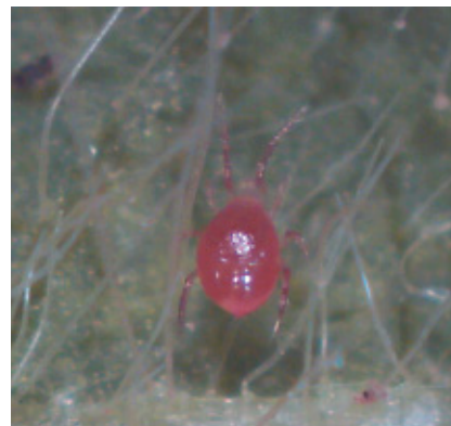
Many growers use Phytoseiulus persimilis to control twospotted spider mites.

If you're going to start a predatory mite program to control twospotted spider mites, you'll need to start backing off products extremely toxic to the beneficials. Doing this will keep your plants from being too "chemically